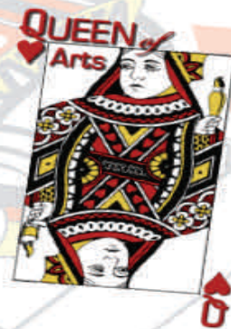
TABLE SPONSORS & SUPPORTERS

Porterdale Mill Lofts Capes Properties Freshway Market The Covington News The Gretsch Foundation www.guitarart.org