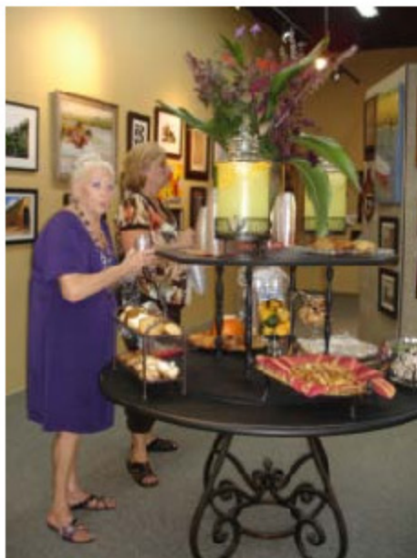
Guests enjoy the refreshments during the show reception..

Southern Heartland Arts, its guild and gallery members, wish to thank UNITED BANK , our many sponsors, the Heartland Woman's Club for hosting our reception, The Covington News for the articles and reminders to its readers to stop by and see the show, and the show committee for all their hard work and support in bringing this wonderful exhibit to Covington and Newton County. Artists from throughout the state were invited to participate and compete for the many prizes and awards. The show was well attended, with many